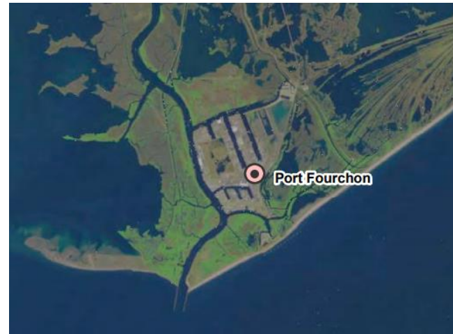
Figure 2: 2018 Port Fourchon Aerial