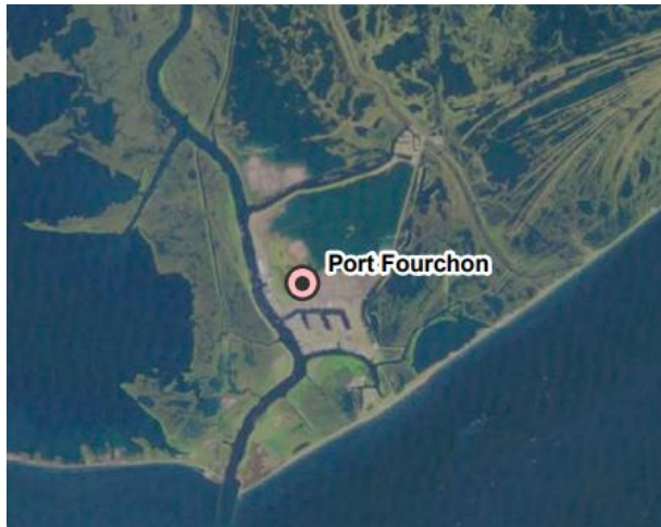
Figure 1: 2000 Port Fourchon Aerial